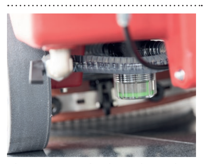
Clean water can be drained completely and comfortably with the fast closure system.