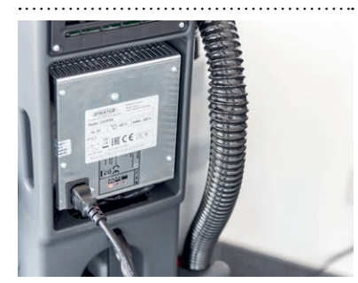
Internal charging station with battery runtime display.