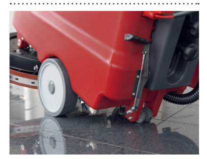
Due to the support wheel, the machine can be transported easily.