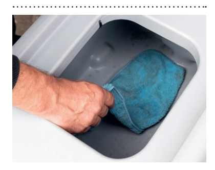
Large, easy to clean waste water tank.