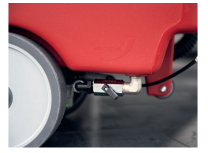
Water amounts can be adjusted individually to floor type.