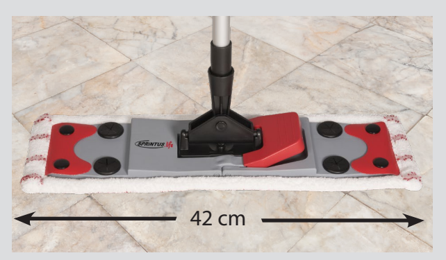
Universal width of 42 cm. Can also be used with commercial pocket mops.

Compact and easy to maneuvre. Rotating joint for difficult to reach places.