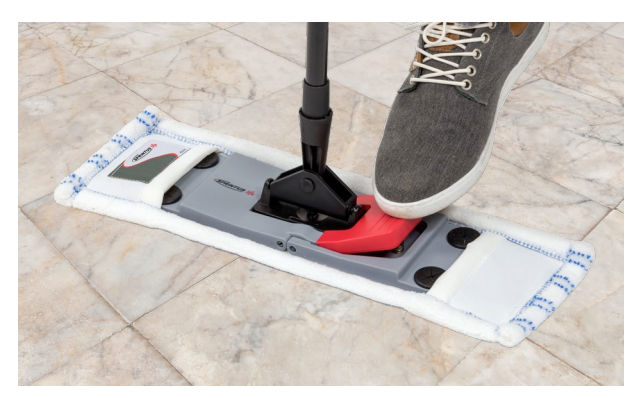
Large footswitch for convenient opening.

Isoscele bracket for easy mop pad attachment in upright position without bending down.