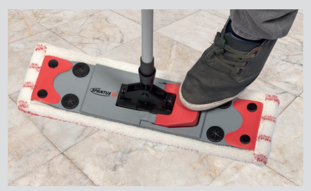
Large footswitch for convenient opening – Mop pad does not have to be picked up with hands.