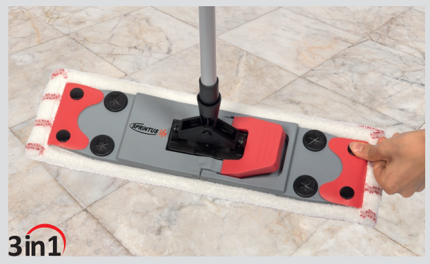
Can be used with duster, pocket mop and bracket mop.