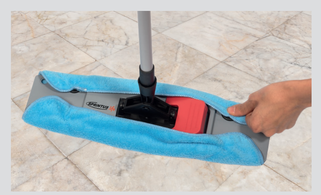
Magnetic dust cloth can be attached conveniently.