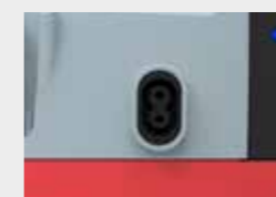
Socket for optional electric vacuum brush. Item-no. 111135