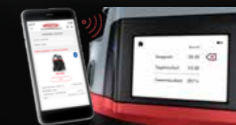
Read out/synchronise device data via Bluetooth interface.