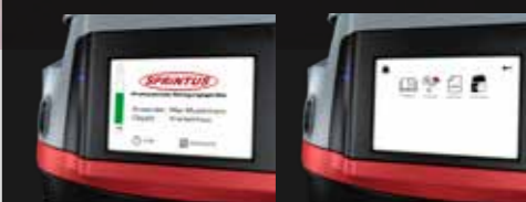
Via the interactive touch display, run times, faults, maintenance activities, as well as the date and time can be read. The home screen is individually adjustable. For example, property and user data can be continuously input and displayed.