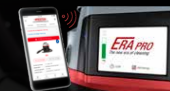
Output of faults and maintenance instructions.