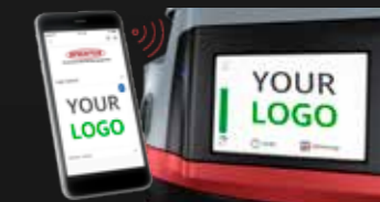
Individualisation via SPRINTUS APP in seconds.