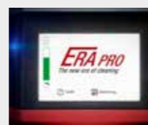
Interactive touch display with current date and time.