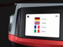
Individual language selection.