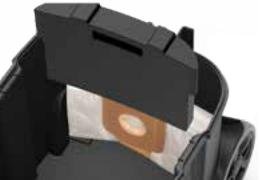
The extra storage space for filter bags saves time and enables changing the filter bag, especially when running out of stock.