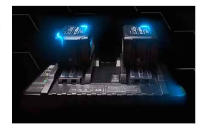
Double - fast charger. Charging time 5 Ah batteries approx. 1 hour. 7.5 Ah batteries approx. 1.5 hours.

The power between 150 - 300 watts can be manually adjusted. Thus, the vacuum suction can be easily customized to the corresponding floor covering at any time.