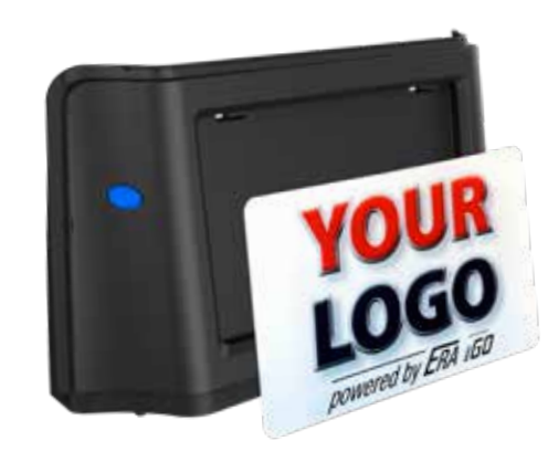
Your brand. Your company image. We imprint your logo.

Owing to a display on the motor head the power level as well as the battery status can be constantly monitored.