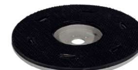
Pad holder. Item-no. 207113