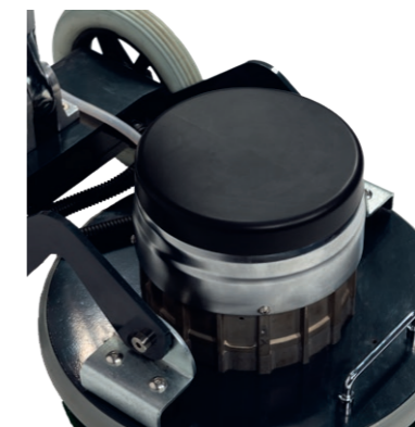
Motor protection cover protects the motor from moisture.