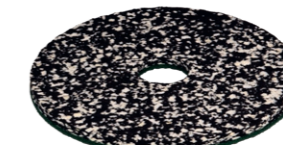
Power Pad for all surfaces. Item-no. 201076