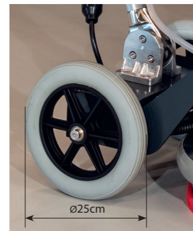
Excellent stairway mobility and stability.