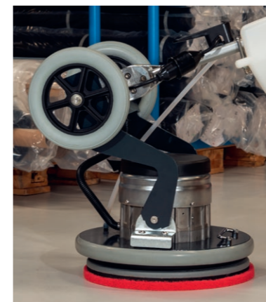
Tilting drawbar for increasing the contact pressure.