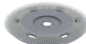
Brush medium. Item-no. 207115

Disc pads for each surface in different degrees of hardness.