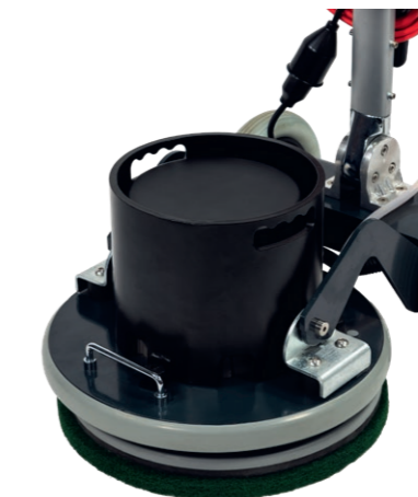
Optional additional weight, 12 kg. Item-no. 207119