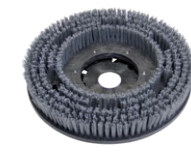
Brush abrasive 15". Item-no. 210428