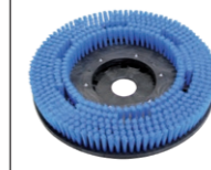
Brush soft 15". Item-no. 210429

Brushes with different degrees of hardness are available for different surfaces.