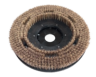
Brush horsehair 15". Item-no. 210430

Tip The horsehair brush is ideal for stoneware and safety tiles.