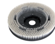
Brush medium 15" (Standard). Item-no. 210427