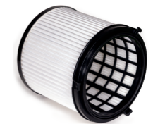
HEPA 13 filter cartridge for dry vacuuming.