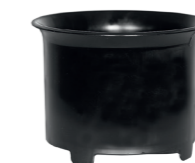
Cyclone insert for wet vacuuming.

Due to the twist of the intake nozzle, the spray-fog is consequently diverted along the inner container wall. Additional filters are no longer necessary. The reliable floater system even reacts during heavy foam growth. Cooling air slots located on the side ensure the consistent separation of cooling and processed air.