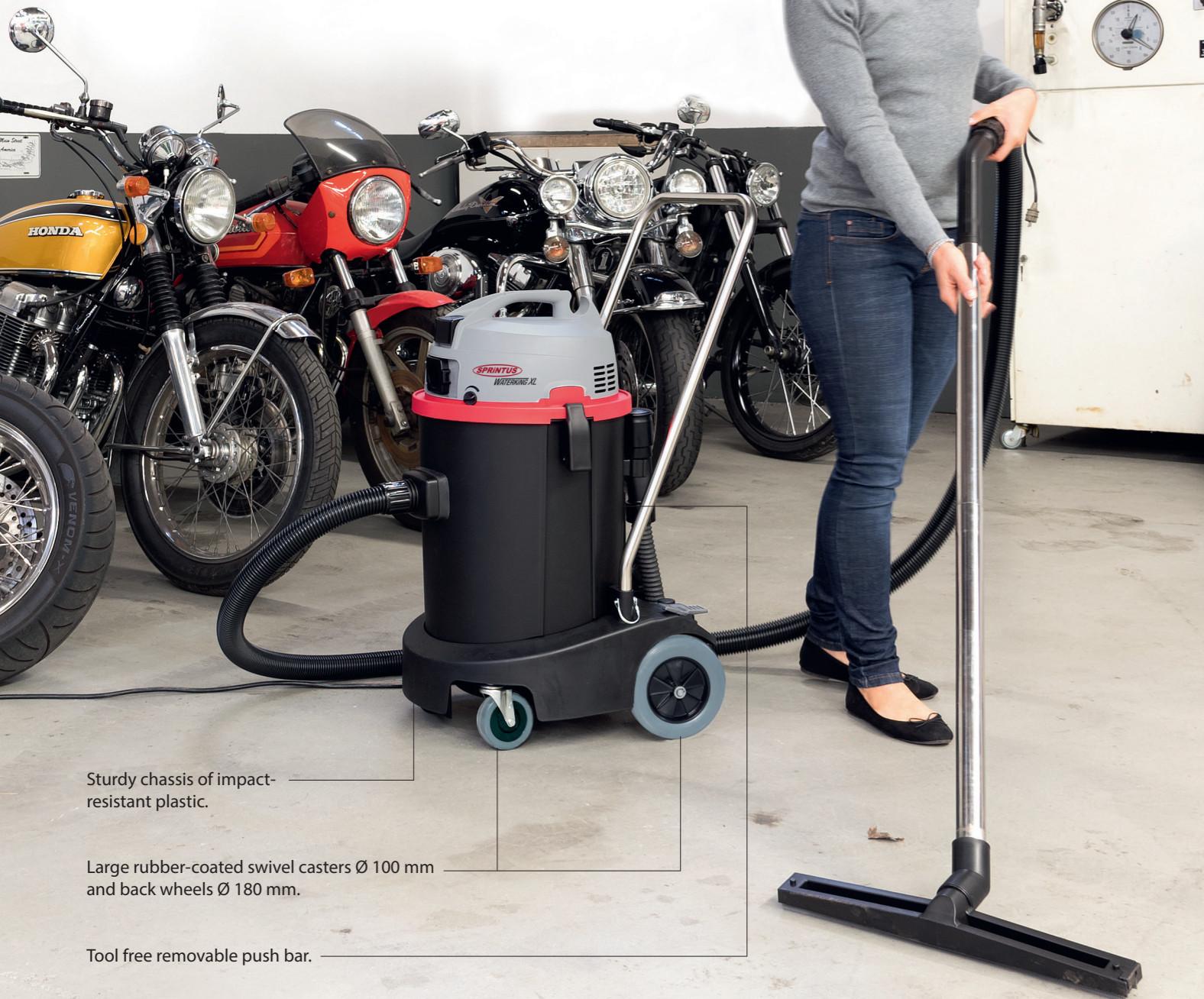
Sturdy chassis of impact-resistant plastic.