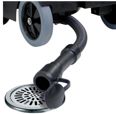
Wastewater drain hose for easy emptying of the container.