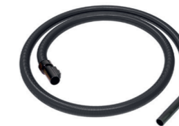
Antistatic suction hose, 3 m. Waterking Item-no. 109112 Waterking XL Item-no. 102116