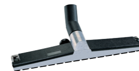
Extremely robust metal floor nozzle, 450 mm. Waterking Item-no. 102051