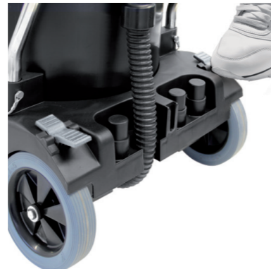
The locking brake can be operated from either side and prevents the vacuum cleaner from rolling away.