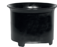
Cyclone insert for wet vacuuming.

Due to the twist of the intake nozzle, the spray-fog is consequently diverted along the inner container wall. Additional filters are no longer necessary. The reliable floater system even reacts during heavy foam growth. Cooling air slots located on the side ensure the consistent separation of cooling and processed air.