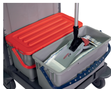
Hand free pick-up with optional V-Wing folding holder (p. 114).