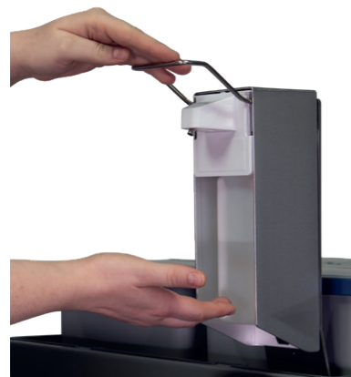
Disinfectant dispenser for 500 ml. Item-no. 301289