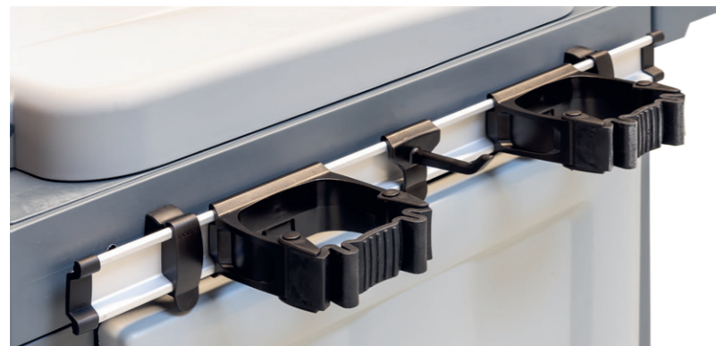
Multi-functional tool holder as standard. Item-no. 305043