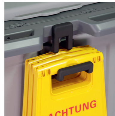
Practical warning sign bracket for up to three warning signs.