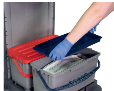
Capacity for 10 pcs. 40 cm mop covers per box.