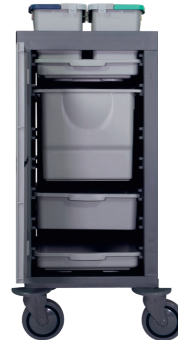
Deep trays, 18 litres in size, optional. Item-no. 305034