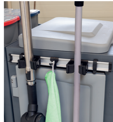
Two additional tool holders can be retrofitted.