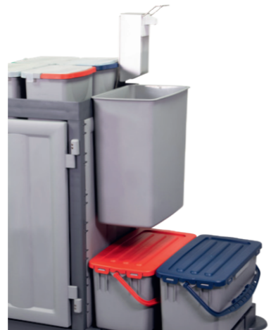
Hook-in 30 litre buckets. Item-no. 305035