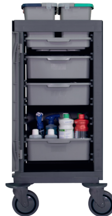
Standard drawers (without accessories).

High loading volume and smooth-running trays.