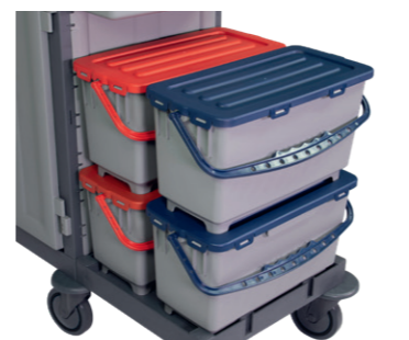
Transport for up to four mop boxes.