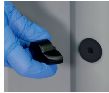
Protection from unauthorised access via removable key connectors.