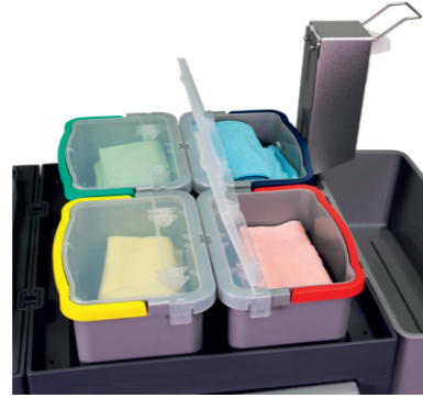
Continuous 4-colour coding. Optimal stability through lowered buckets.