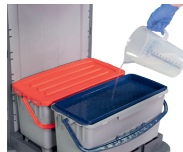
Optional soaking aid. Item-no. 305032 blue & 305033 red