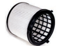
HEPA 13 filter cartridge for dry vacuuming.