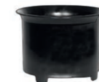
Cyclone insert for wet vacuuming.

Due to the twist of the intake nozzle, the spray-fog is consequently diverted along the inner container wall. Additional filters are no longer necessary. The reliable floater system even reacts during heavy foam growth. Cooling air slots located on the side ensure the consistent separation of cooling and processed air.