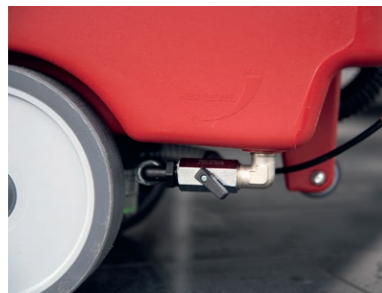
Water amounts can be adjusted individually to floor type.