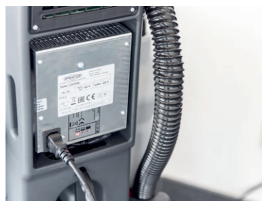
Internal charging station with battery runtime display.