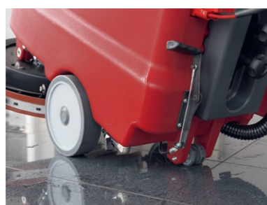
Due to the support wheel, the machine can be transported easily.