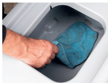
Large, easy to clean waste water tank.