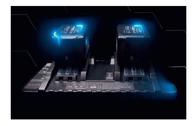
Double - fast charger. Charging time 5 Ah batteries approx. 1 hour. 7.5 Ah batteries approx. 1.5 hours.

The power between 150 - 300 watts can be manually adjusted. Thus, the vacuum suction can be easily customized to the corresponding floor covering at any time.