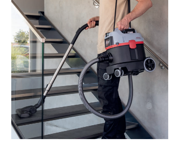
Thanks to the integrated, extendable carrying strap, you can easily carry the lightweight and compact vacuum cleaner over your shoulder especially in confined spaces and stairwells.