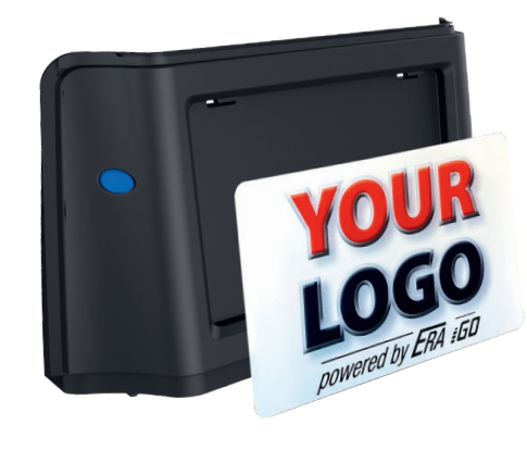
Your brand. Your company image. We imprint your logo.

Owing to a display on the motor head the power level as well as the battery status can be constantly monitored.