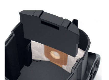
The extra storage space for filter bags saves time and enables changing the filter bag, especially when running out of stock.