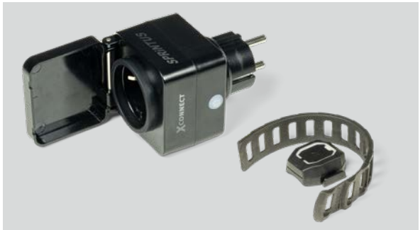
Xconnect Set: Receiver EU, Transmitter & replacement strap