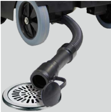
Wastewater drain hose for easy emptying of the container.