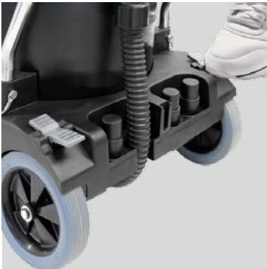
The locking brake can be operated from either side and prevents the vacuum cleaner from rolling away.