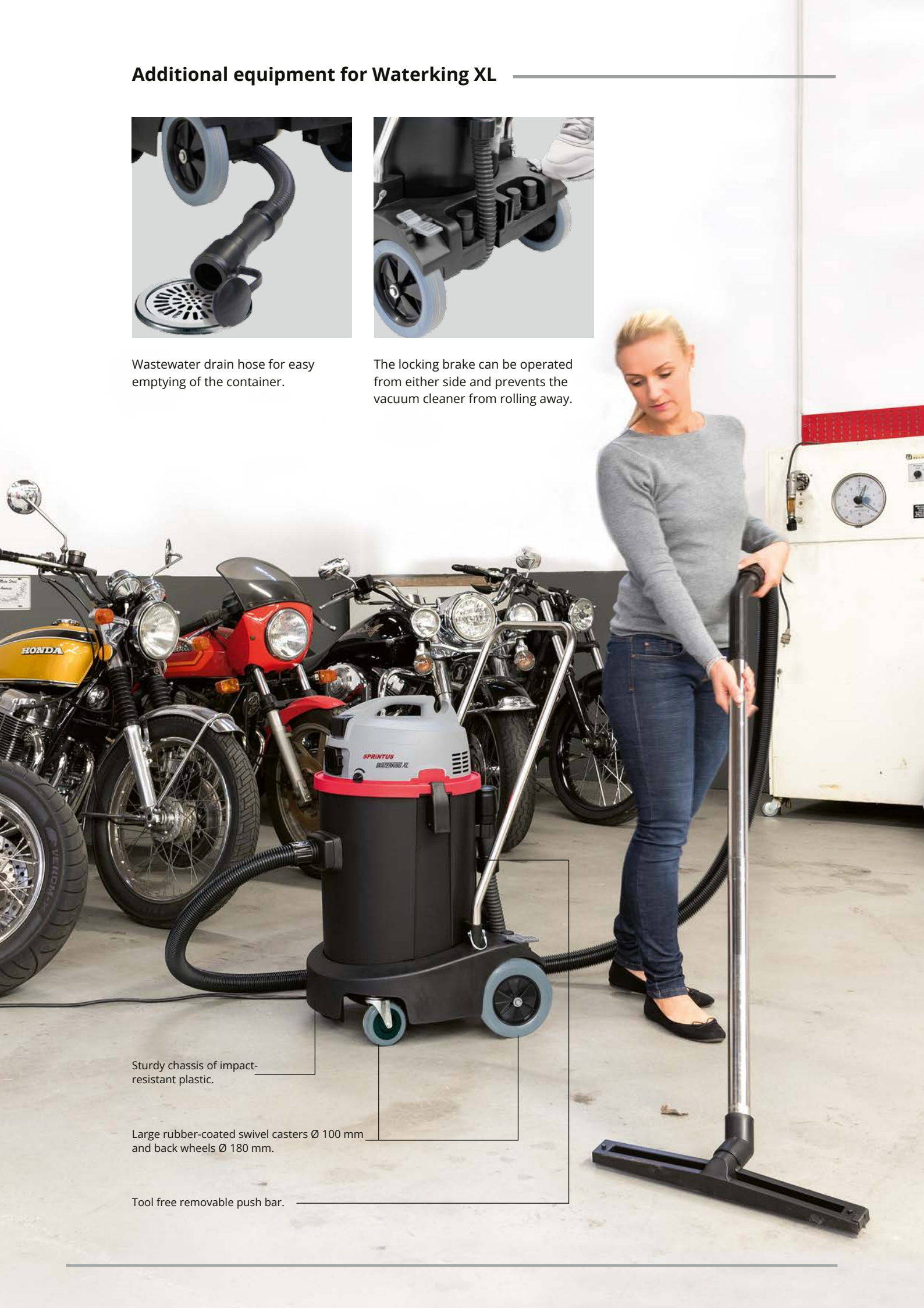
Sturdy chassis of impact-resistant plastic.