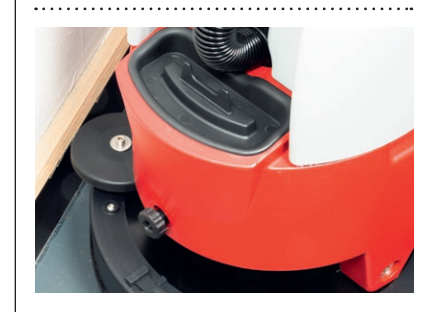
Rubberised guard roller allows for cleaning that is damage-free and close to floor edges.