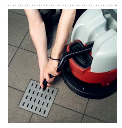
The dirty water tank can be emptied via the drain hose.