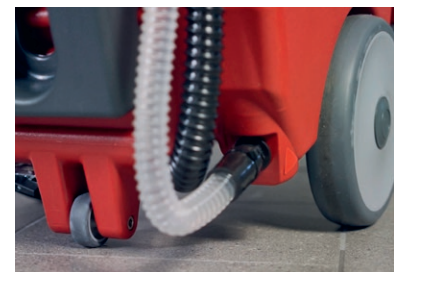
The machine can be easily transported via the support wheel.