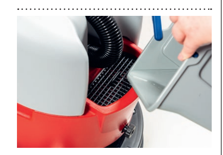
Easy filling of the 15-litre clean water