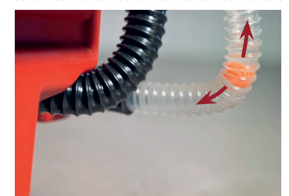
Practical fresh water indicator.