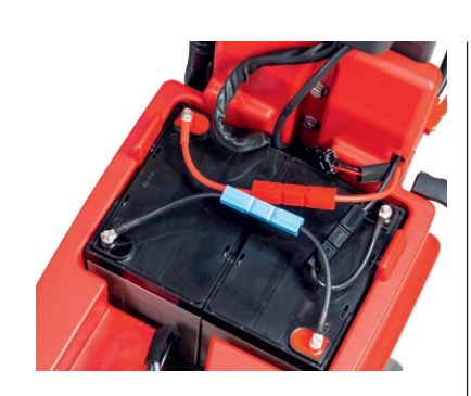
The maintenance-free gel batteries can be removed without tools via quick-connect couplings.