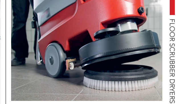
Comfortable brush ejection at the push of a button.