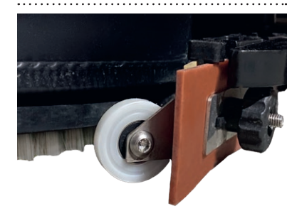
Long lasting ball-bearing wheels.