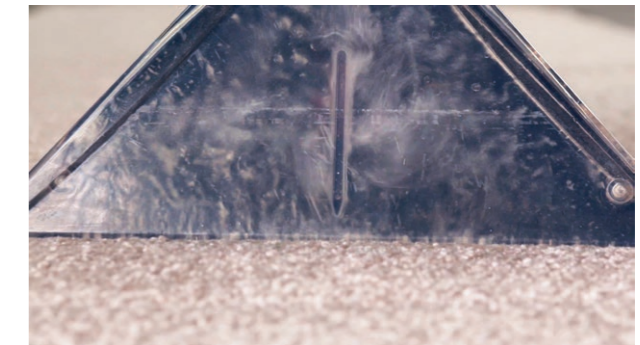
Subsequent vacuuming up of the dirt, including liquid.