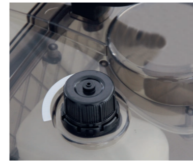
A separate tank allows for the use of anti-foaming agent and guarantees problem-free work.