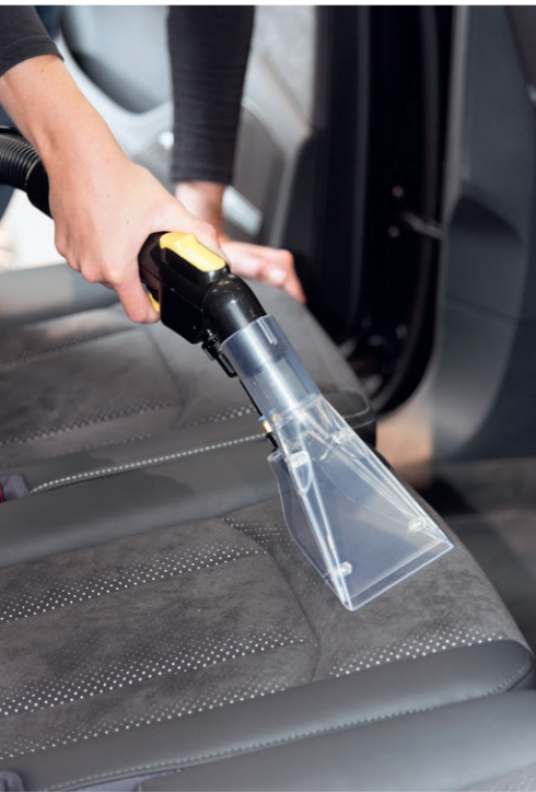
Clear upholstery nozzle for cleaning vehicle seats etc. The spray function can be adjusted via the operating lever on grip.