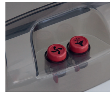
Spray-and vacuum-function are separately switchable at the device.