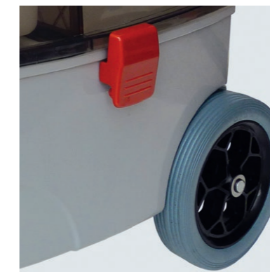
Large rubberwheels for silent running on tiles and mark free running on sensitive surfaces.