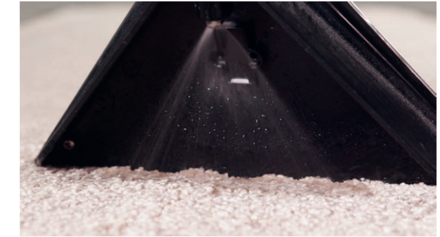
Cleaning agent is sprayed on as needed.