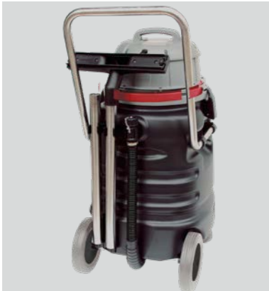
Backsides of the device accessories are easily accessible, while stored safely.