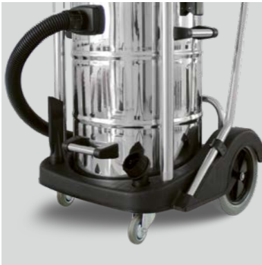
Sturdy frame with accessories slots and vacuum tube parking position.