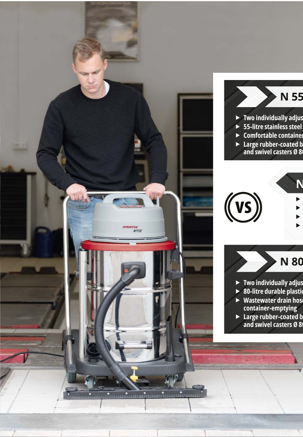
N 80 / 2 K