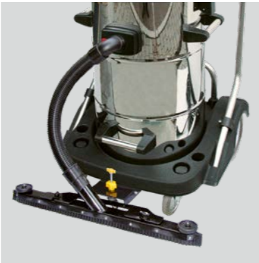
Optional The 650 mm gangway nozzle can be easily operated with the foot pedal on the backside of the vacuum cleaner. N 55/2 E Item-no. 102010 N 77/3 E Item-no. 103010