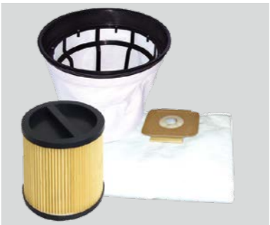
The fine dust cartridge, fleece filter basket and fleece filter bag guarantee an extra high filtration rate.