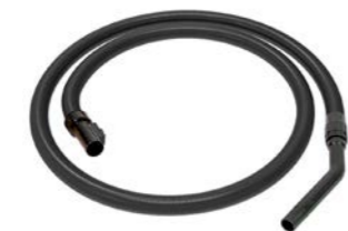
Antistatic suction hose, 2,5 m. Item-No. 118193