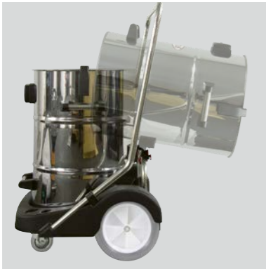
The tilting function allows ergonomic emptying.