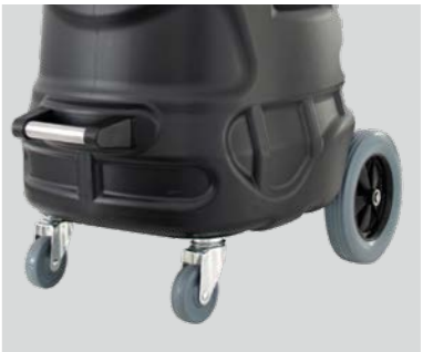
Larger rubber coated wheels for high comfort and silent running, even on sensitive floors.