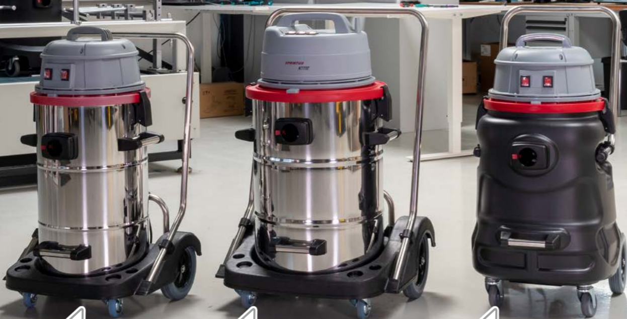
N 55 / 2 E