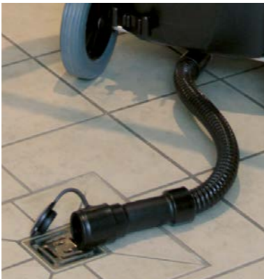
Integrated wastewater drain hose for easy emptying of the container.