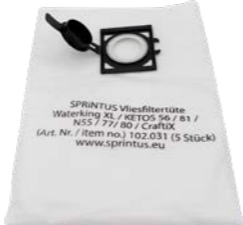
Fleece filter bags Item-No. 102031 35 L Item-No. 102072 50 L