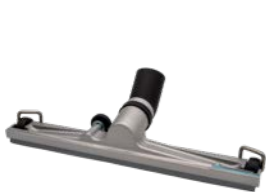
Professional metal floor nozzle 450 mm for the toughest jobs. Item-No. 113250