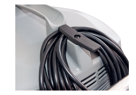
Large, lockable cable hook, thanks to its swivel joint.

The two devices are equipped with an easily removable filter cartridge on the exhaust side, upgradable to