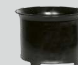
Cyclone insert for wet vacuuming.

Due to the twist of the intake nozzle, the spray-fog is consequently diverted along the inner container wall. Additional filters are no longer necessary. The reliable floater system even reacts during heavy foaming. Cooling air slots located on the side ensure the consistent separation of cooling and processed air.