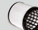
HEPA 13 filter cartridge for dry vacuuming.