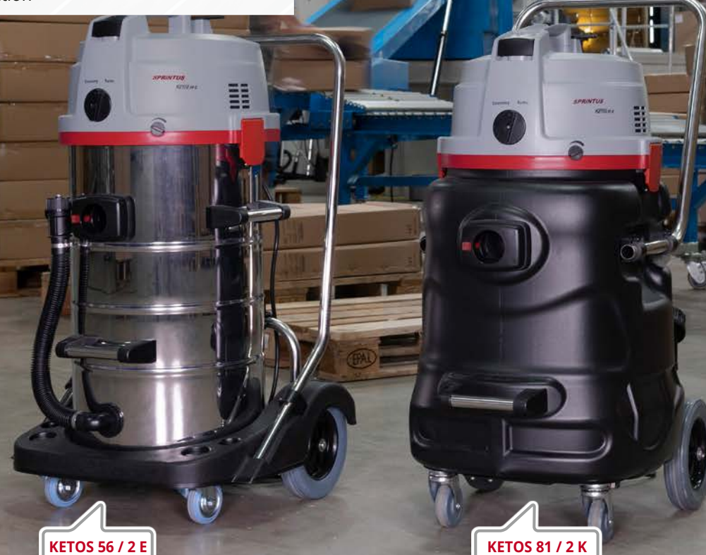
KETOS 56 / 2 E