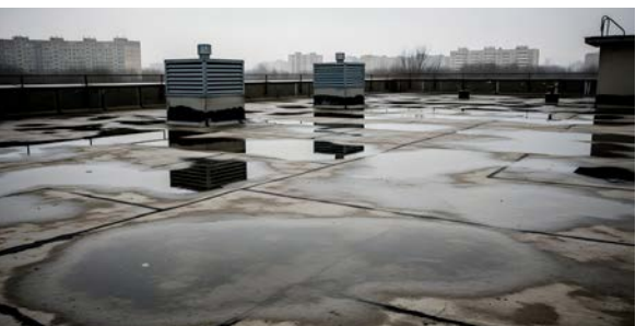
flat roof renovation