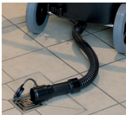
Integrated wastewater drain hose for easy emptying of the container.