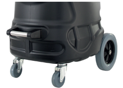
Larger rubber coated wheels for high comfort and silent running, even on sensitive floors.