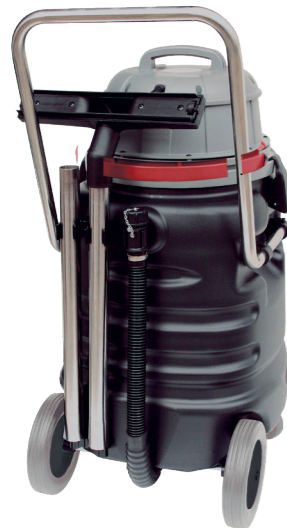
Backsides of the device accessories are easily accessible, while stored safely.