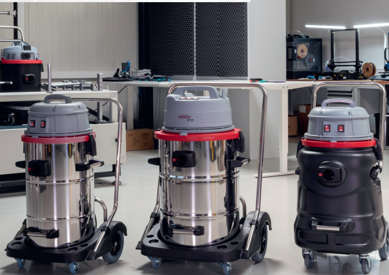
N 55/2 E