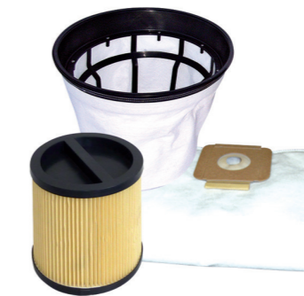
The fine dust cartridge, fleece filter basket and fleece filter bag guarantee an extra high filtration rate.