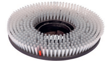
Brush medium. Item-no. 205121