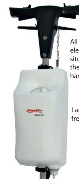
All operating elements are situated on the ergonomic handle.