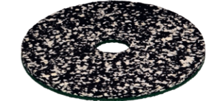
Power Pad. Item-no. 201076