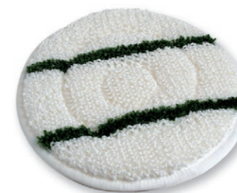
The Queen Bonnet pad for the best cleaning results on carpets and carpeted floors. Item-no. 201009