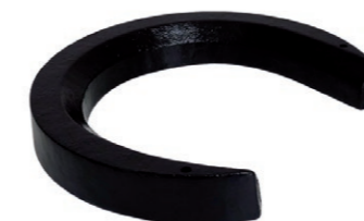
Additional 14 kg weight. Item-no. 201068