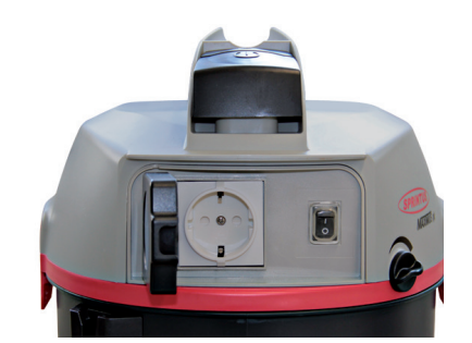
Automated power socket for the use of power tools.