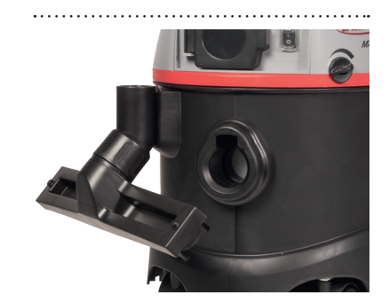
Parking position for accessories on the side of the device.