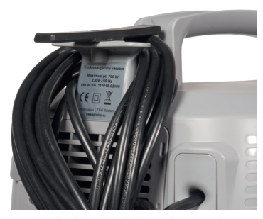
Large, lockable cable hook, thanks to its swivel joint.