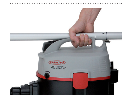
Maximum ergonomics: the vacuum and all its accessories can be transported in one hand.