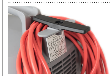
Large, lockable cable hook, thanks to its swivel joint.