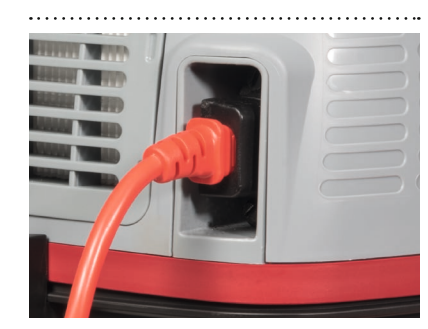
Enhanced safety: Signal-red, pluggable 10 m power