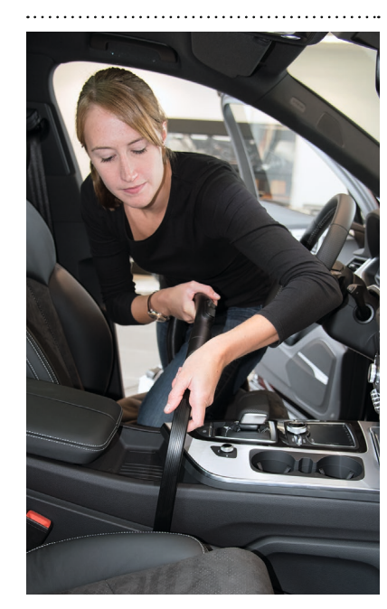
Optional: Flexible crevice nozzle 600mm, Item no. 111.203