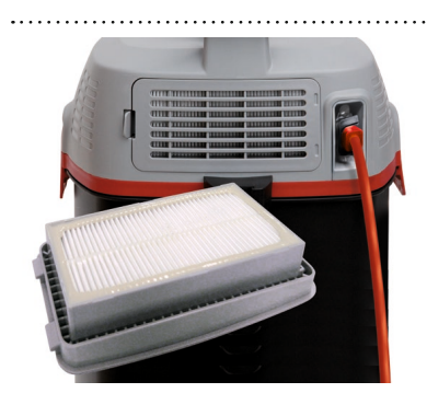
The MAXIMUS pro is equipped with an integrated, removable EPA12 filter cartridge.