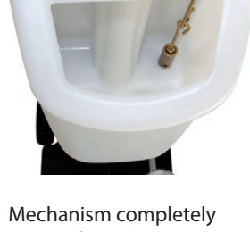
made of metal. Parts that come into contact with